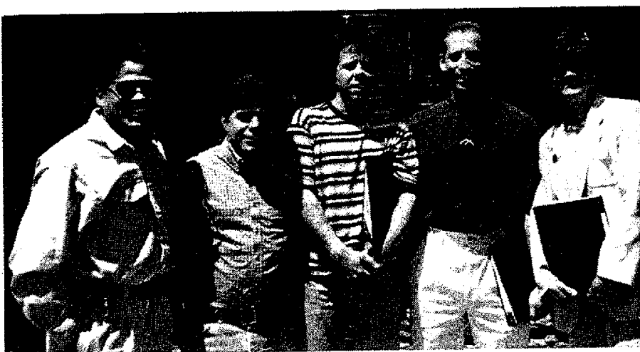
"Yes, officer, I think it was the third one from the left."