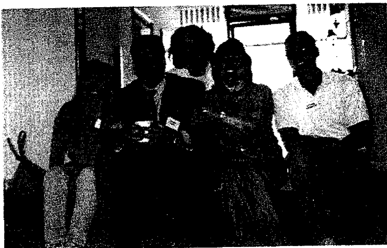
Joe 3, Art 0