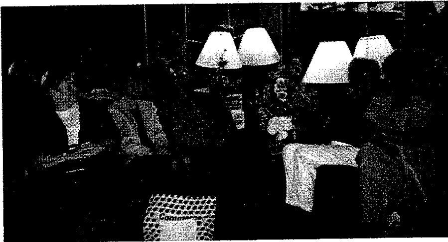
Mirror, Mirror on the wall, Who's the fairest of them all? (Hint: not the moustache!)