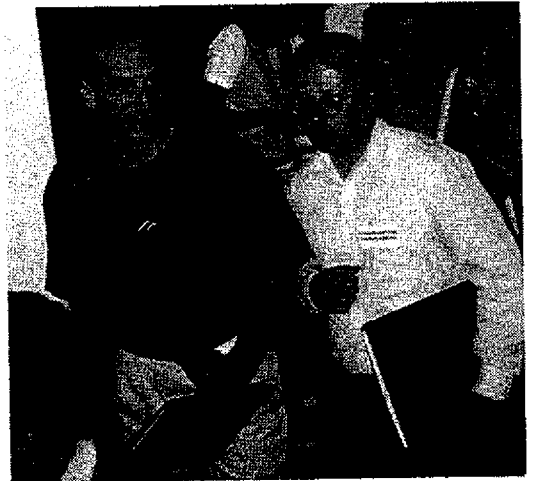
"They gave us these cool red Rutgers notebooks!"