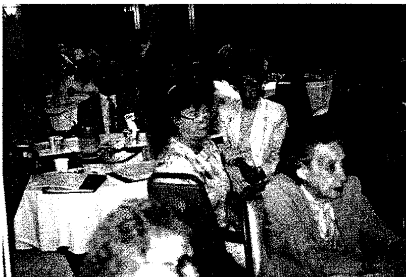
It's time once again for the annual June Conference. This is a shot from last year's conference. This year it will be at the Somerset DoubleTree on June 2-4.

Next issue August 1998 Deadline for submission July 20, 1998