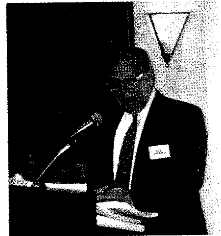
Don't cry, Saul. We still love you.