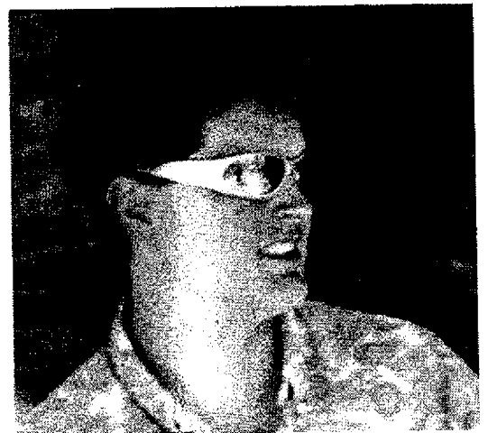
Who was that Masked Man?