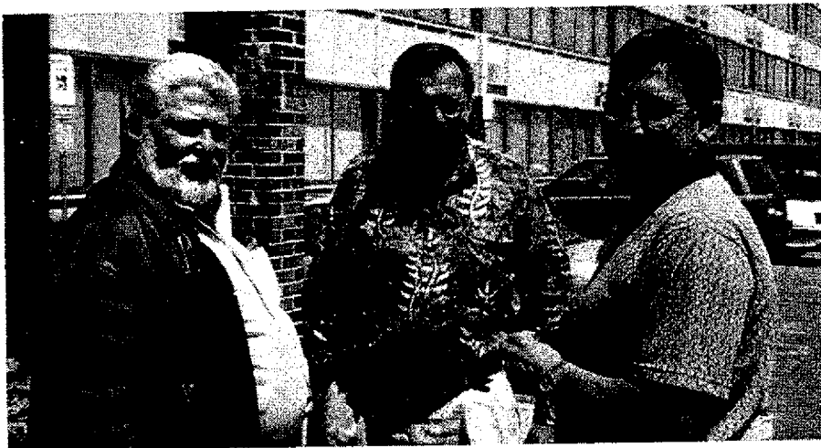
"Ho, Ho, Ho!"