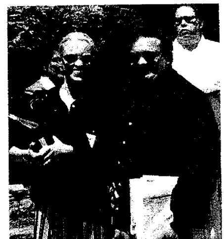
Good Morning, Sunshine!