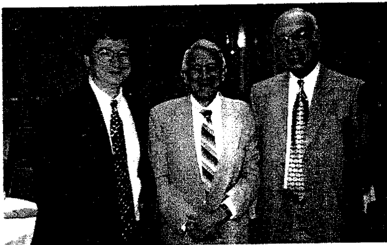
"I think I've died and gone to Heaven. Between my heroes!"